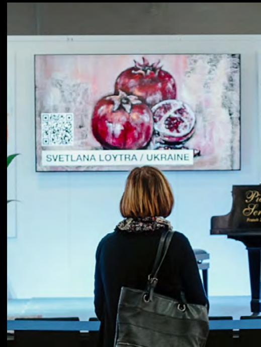
Art Display Digital Exhibition